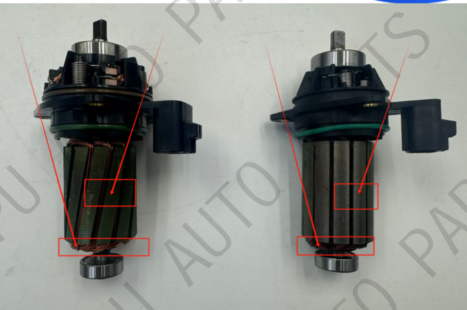
5. wire enamel